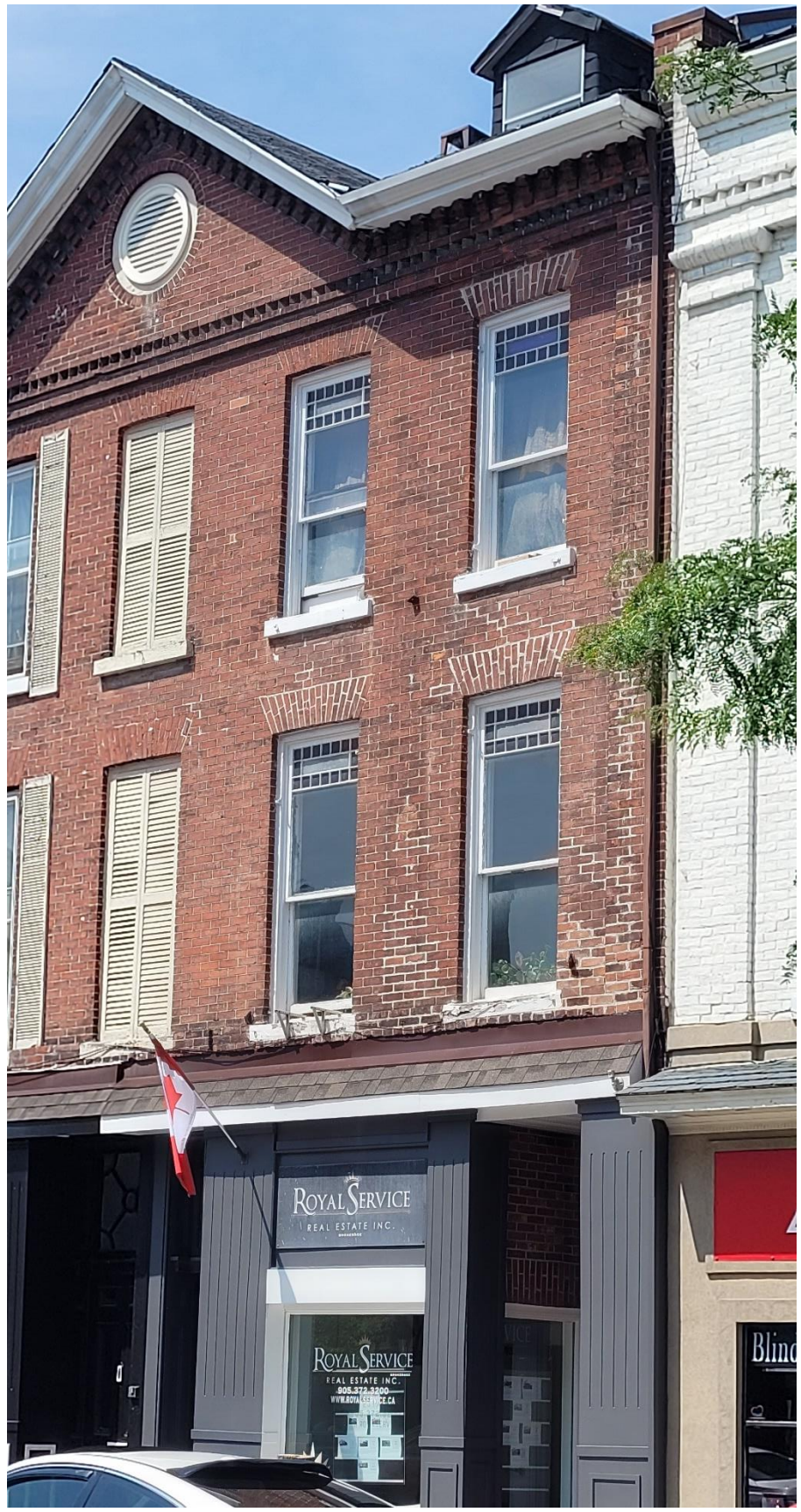
Figure 2: 36 King St. W – Storefront