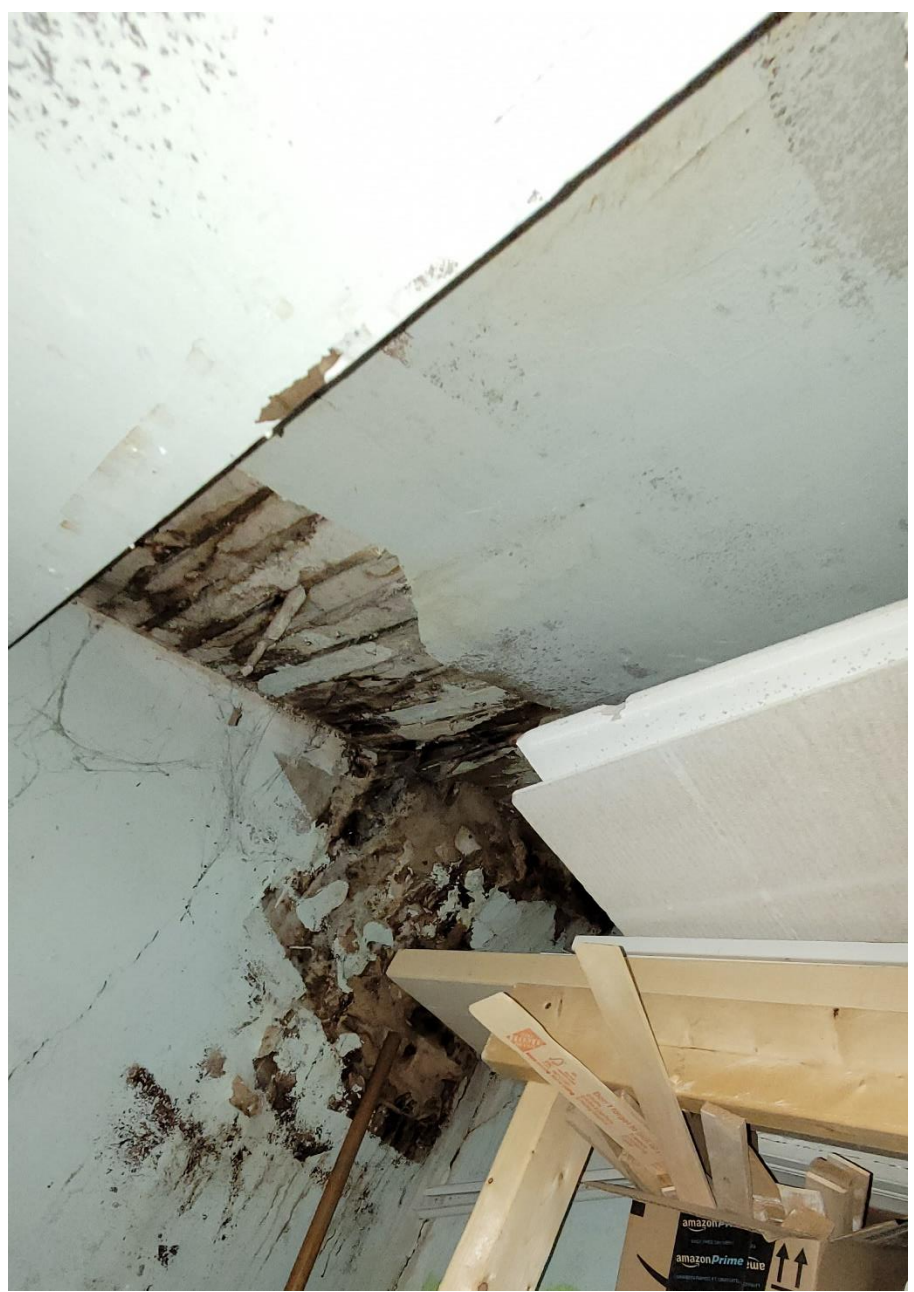
Figure 6: 36 King St. W – photo showing roof leak damage on the interior – black mould?