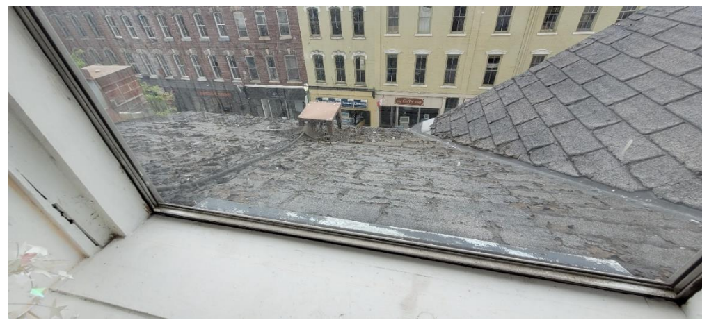
Figure 1: 36 King St. W – current condition of a portion of the roof