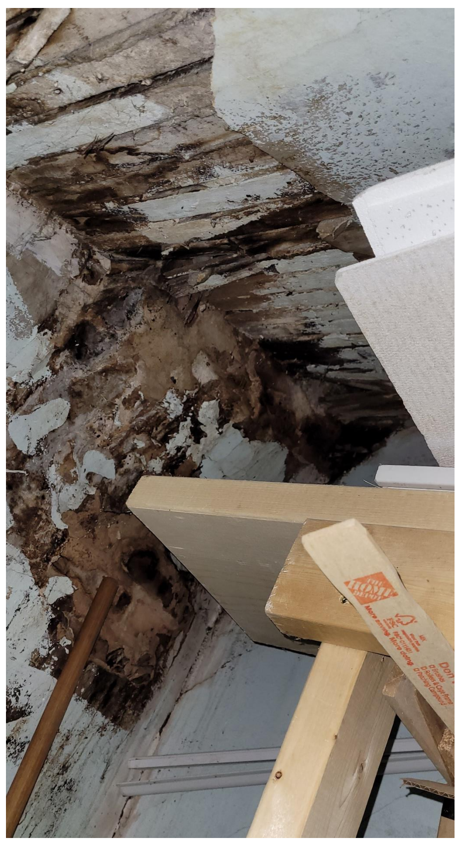
Figure 5: 36 King St. W – photo showing roof leak damage on the interior – black mould?