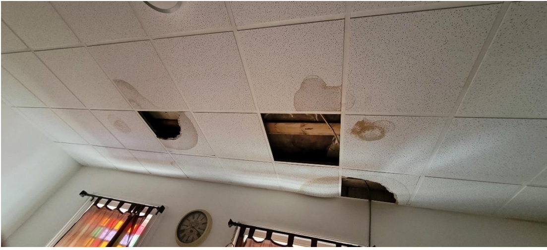
Figure 3: 36 King St. W – photo showing roof leak damage on the interior