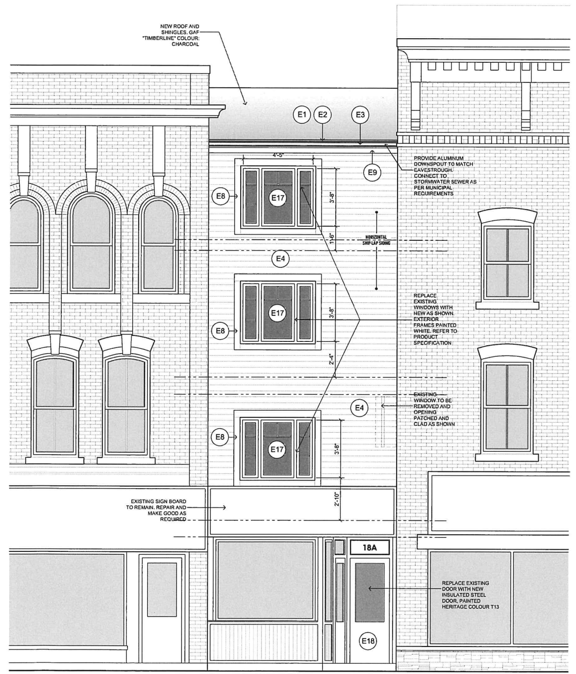
1 PRELIMINARY KING STREET ELEVATION SCALE: 3/8" = 1'-0"