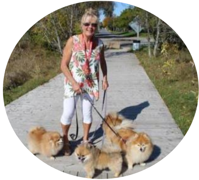
Health & happiness