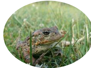
Our safe haven