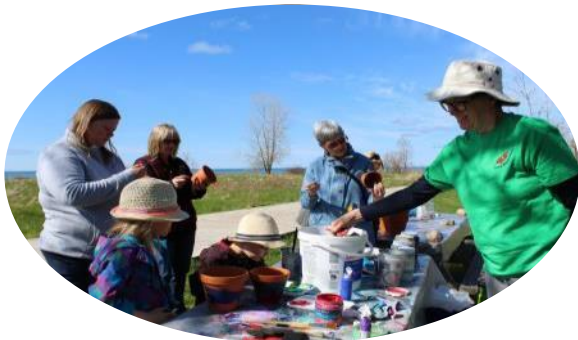
Paint & Pot for Mom