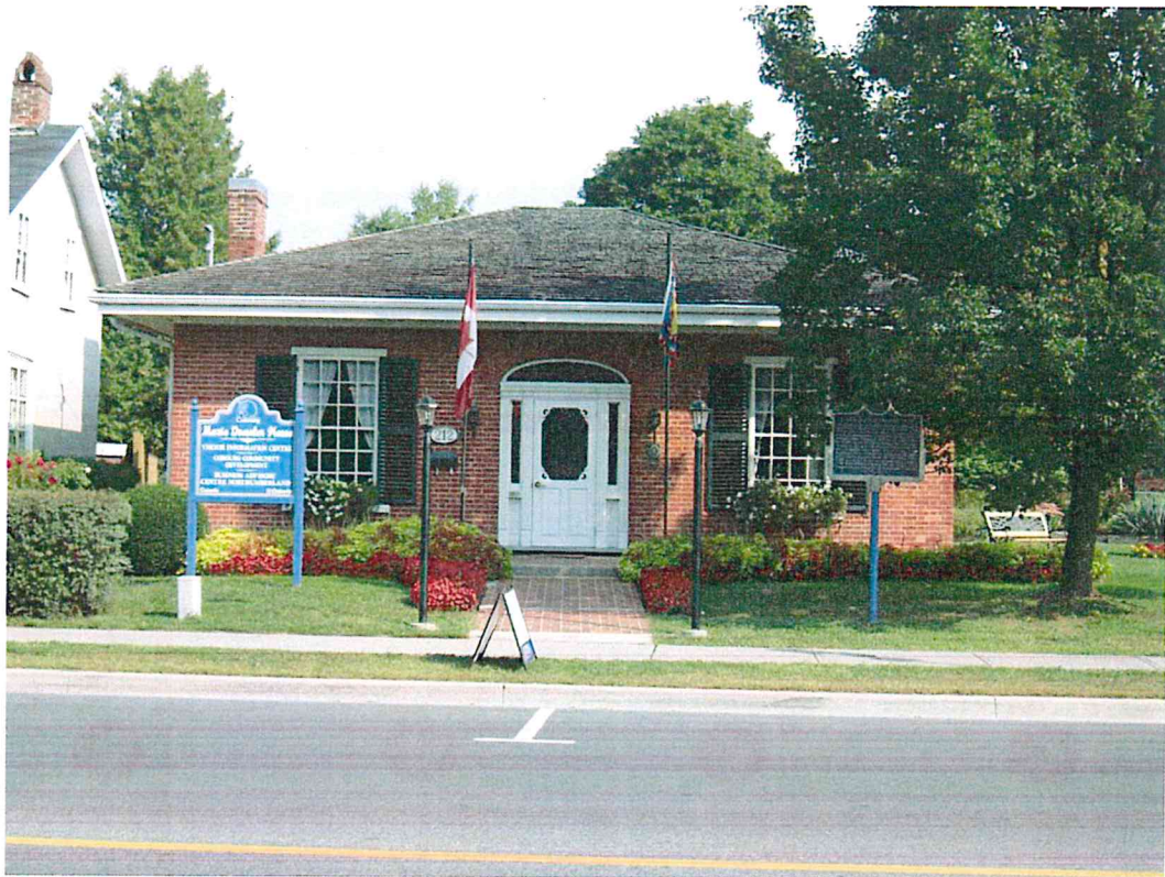
Figure 1: 212 King St. W (Dressler House) as seen from King St. W – file photo (2012)