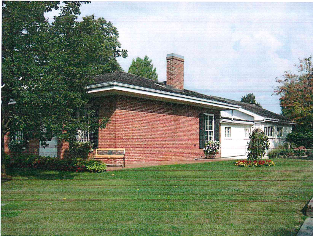
Figure 2: 212 King St. W (Dressler House) looking north-west from King St. W