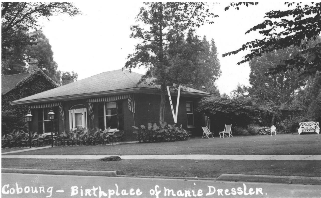
Figure 3: 212 King St. West (Dressler) seen in this un-dated photo – notice the roof does not appear to be cedar shake, but some other unconfirmed material composition (slate or shingle)