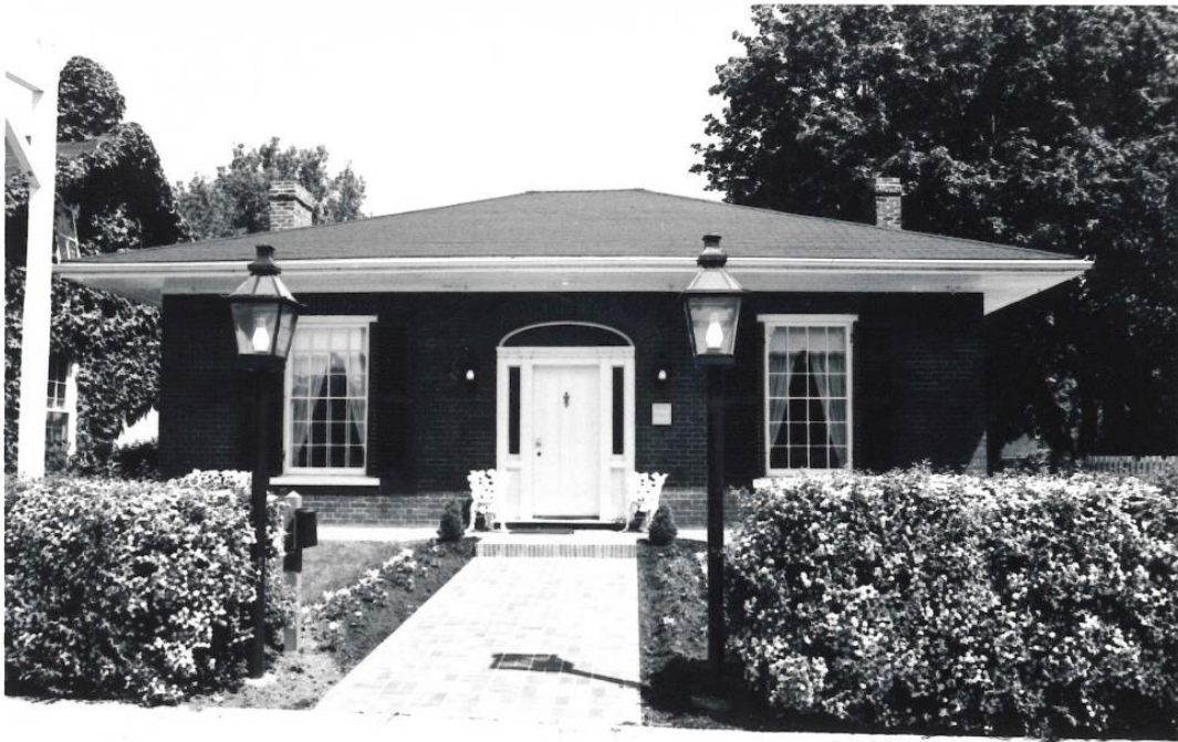
Figure 4: 212 King St. W (Dressler) seen in this photo from the 1980s property file. Notice the roof again appears to be a different material than cedar shake (unconfirmed)