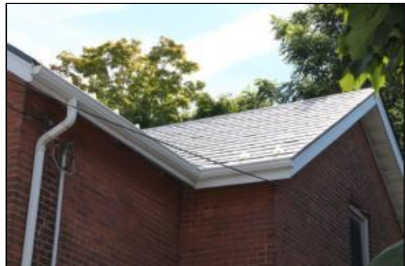
Composite roof materials may be an appropriate replacement material.