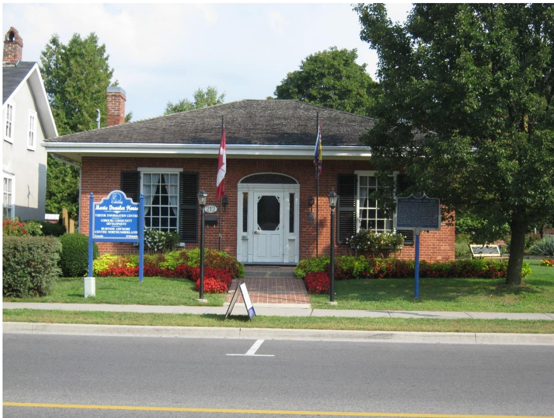
Figure 1: 212 King St. W (Dressler House) as seen from King St. W – file photo (2012)