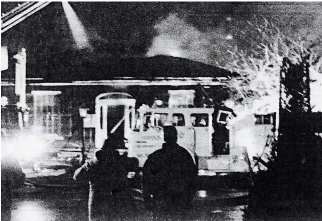
Fire at Dressler House - January 1989

Figure 10: 212 King St. W. (Dressler) – seen during fire in 1989