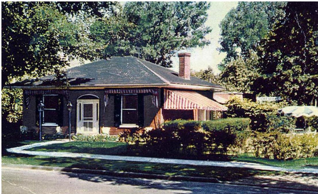
Above is Marie Dressler House in its prime days as a Restaurant in the 1950's Figure 8: 212 King St. W. (Dressler) – use as a restaurant in the 1950's – roof material unknown