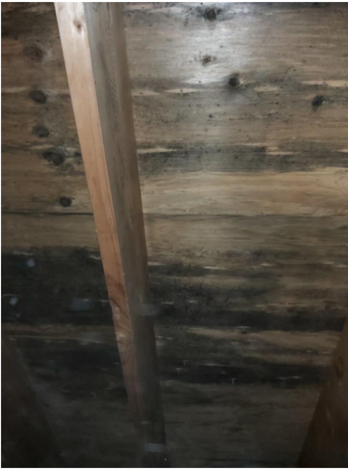
Figure 16: 212 King St. W (Dressler House) interior attic roof damage