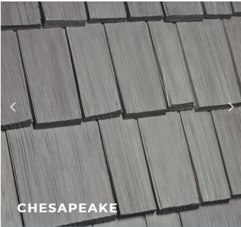
Figure 18: Davinci polymer “cedar shake” shingle in a similar colour to existing. https://www.davinciroofscapes.com/products/shake/bellaforte-shake/

In summary, Heritage and Planning staff does not recommend using the proposed fibreglass shingle product to replace the existing deteriorating cedar shakes on the front and rear sections of the building, but rather recommends using a composite polymer shake material by Davinci (or equivalent) in “Chesapeake” colour to more closely match the existing polymer shake currently in use on the central section of the building. Staff’s recommended approach for this polymer shake has been evaluated against the West HCD Plan, specifically the policy relating to roofs (4.2), and it is our opinion that the new roof on the front and rear sections of the building (change from cedar wood shake to a polymer shake) is an acceptable, complementary alteration and would be consistent with the central section that already exists today. The roofline and chimneys, and other defined heritage attributes, are not proposed to be changed as a result of this alteration. The applicant has retained Ontario Roofing as the contractor to undertake the proposed alteration.