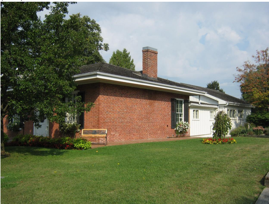
Figure 2: 212 King St. W (Dressler House) looking north-west from King St. W