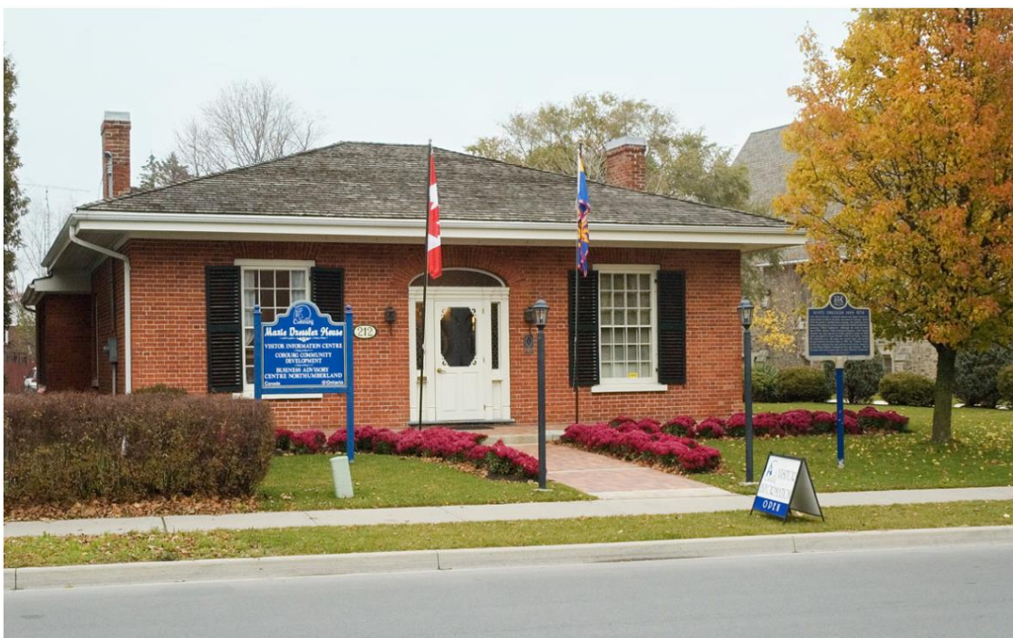
Figure 11: 212 King St. W. (Dressler) – seen in 2007 – cedar shake roof

Figure 10: 212 King St. W. (Dressler) – seen during fire in 1989