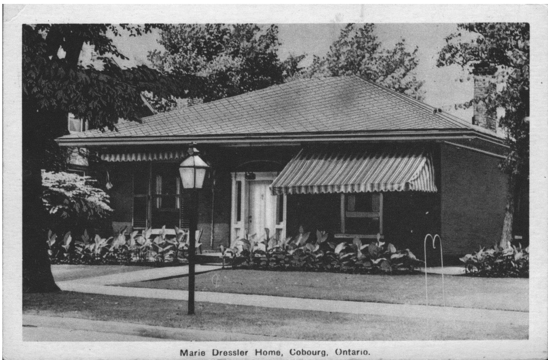
Marie Dressler Home, Cobourg, Ontario.