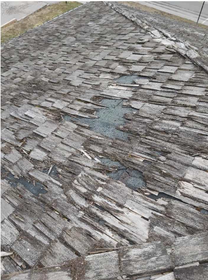
Figure 13: 212 King St. W (Dressler House) roof damage