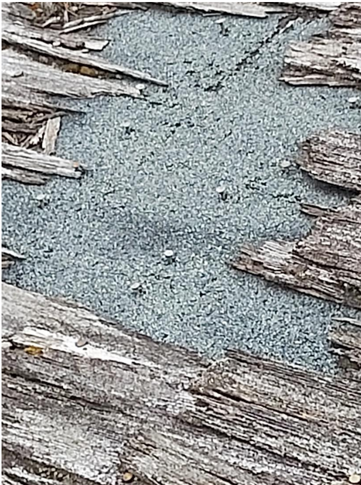
Figure 14: 212 King St. W (Dressler House) roof damage