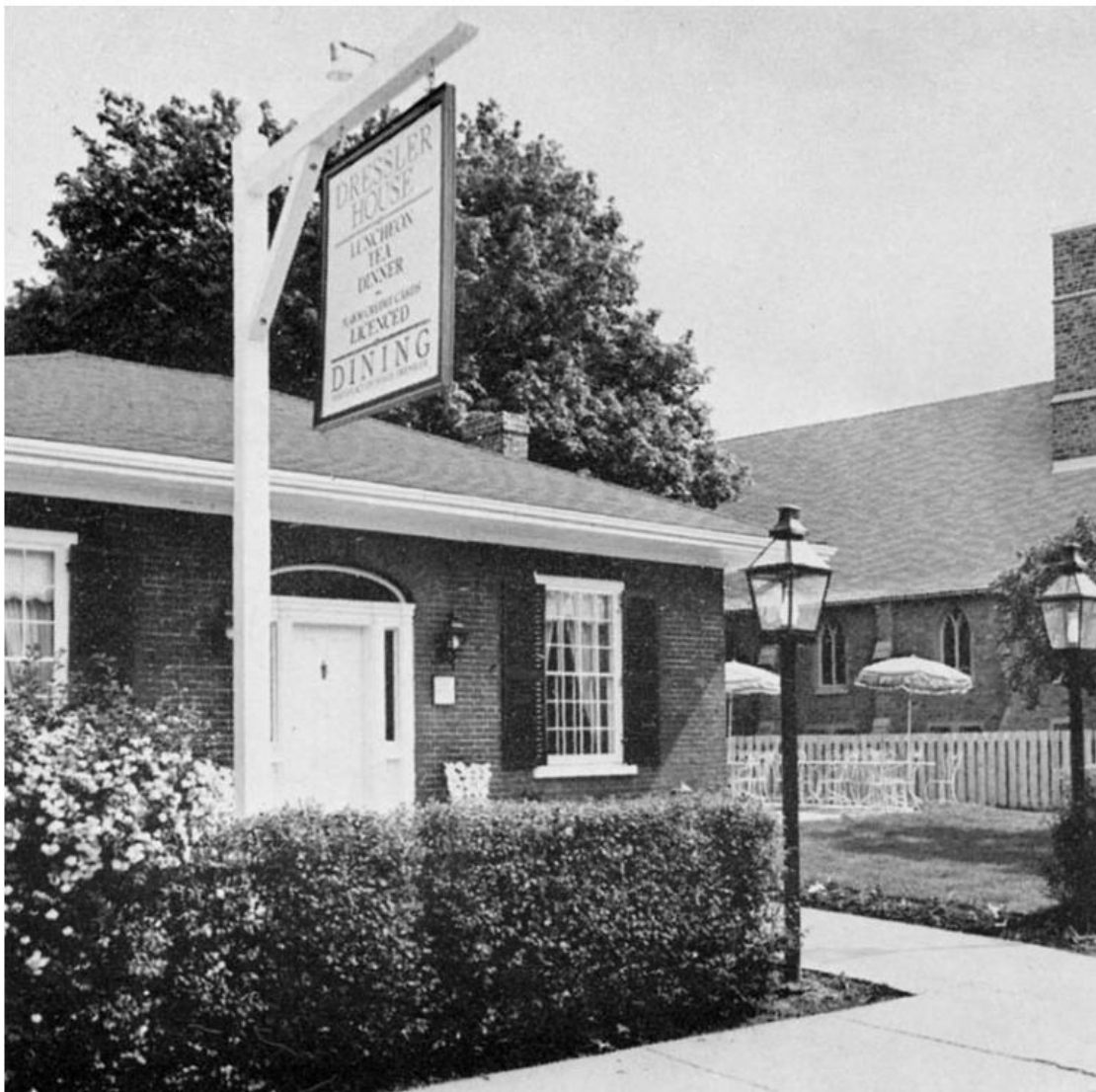
Figure 9: 212 King St. W. (Dressler) – seen in an undated photo as a restaurant – roof material unknown, but appears to possibly be shingle – Photo Credit: Marie Dressler Foundation