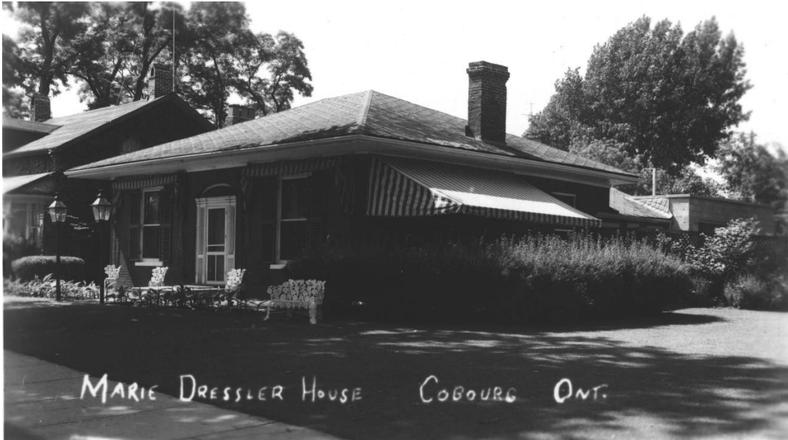
Figure 6: 212 King St. W (Dressler) – seen in an un-dated photo – appears to be during the days when the property was a restaurant – roof material unclear – Photo Credit: County Archives.