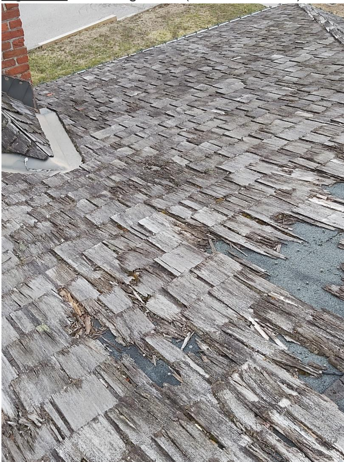
Figure 15: 212 King St. W (Dressler House) roof damage