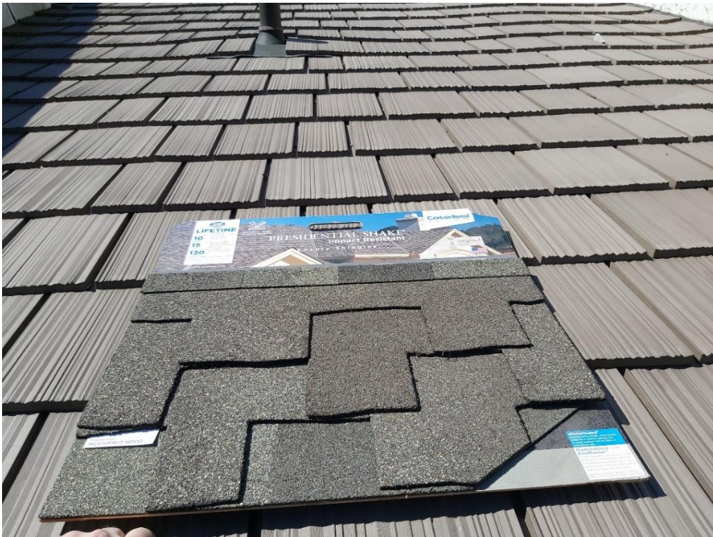
Figure 17: 212 King St. W (Dressler House) existing composite polymer shake roofing material and the proposed Presidential Shake shingle product.