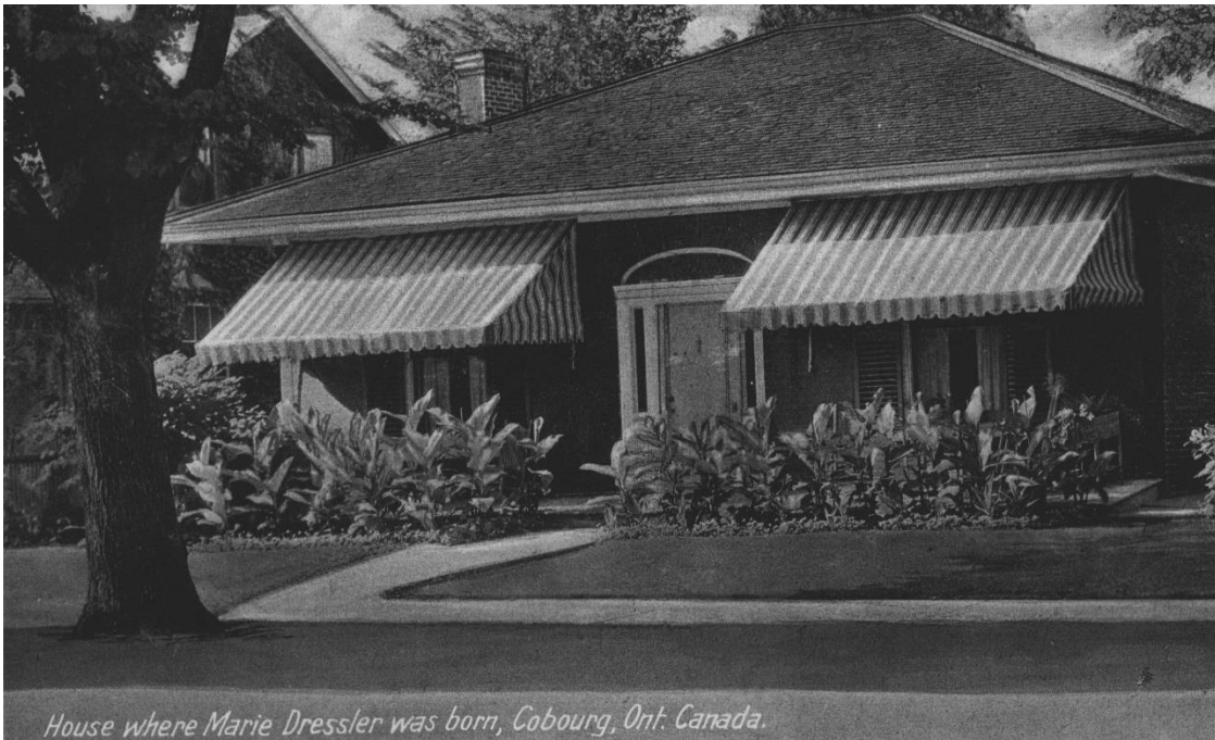
Figure 7: 212 King St. W (Dressler) – seen in an un-dated photo – roof looks to have changed to cedar shake, but unconfirmed